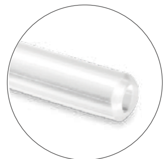
Open, rounded end.