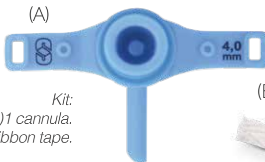
Kit: (A) 1 cannula. (B) 1 Fixation ribbon tape.