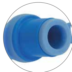
Universal 15 mm connector (can be fitted to ventilator).