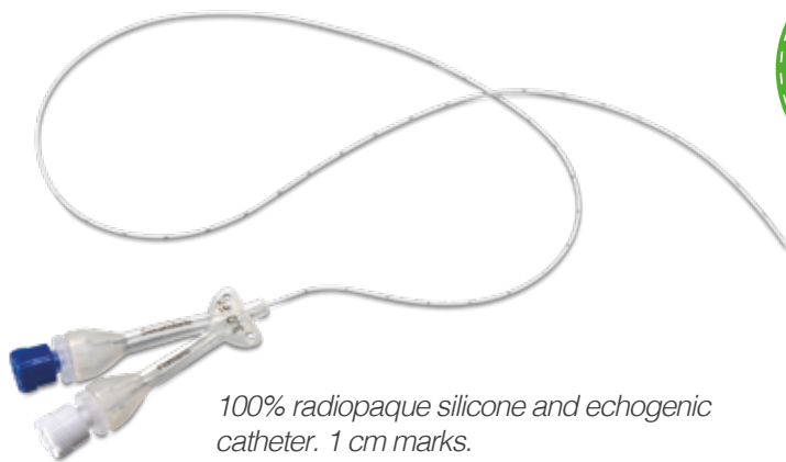
100% radiopaque silicone and echogenic catheter. 1 cm marks.