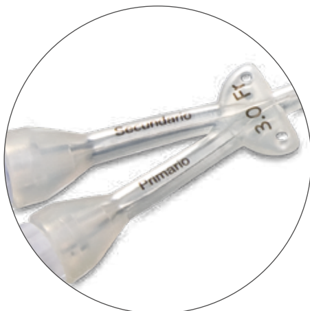
Double lumen facilitates administration of incompatible solutions.