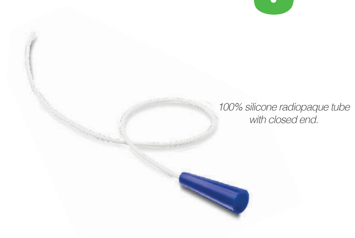
100% silicone radiopaque tube with closed end.