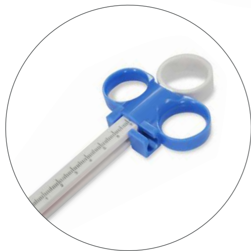
Ergonomic pincer and graduated rule for greater control in the insertion of guide.