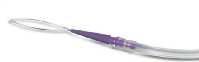
Greater loop opening.